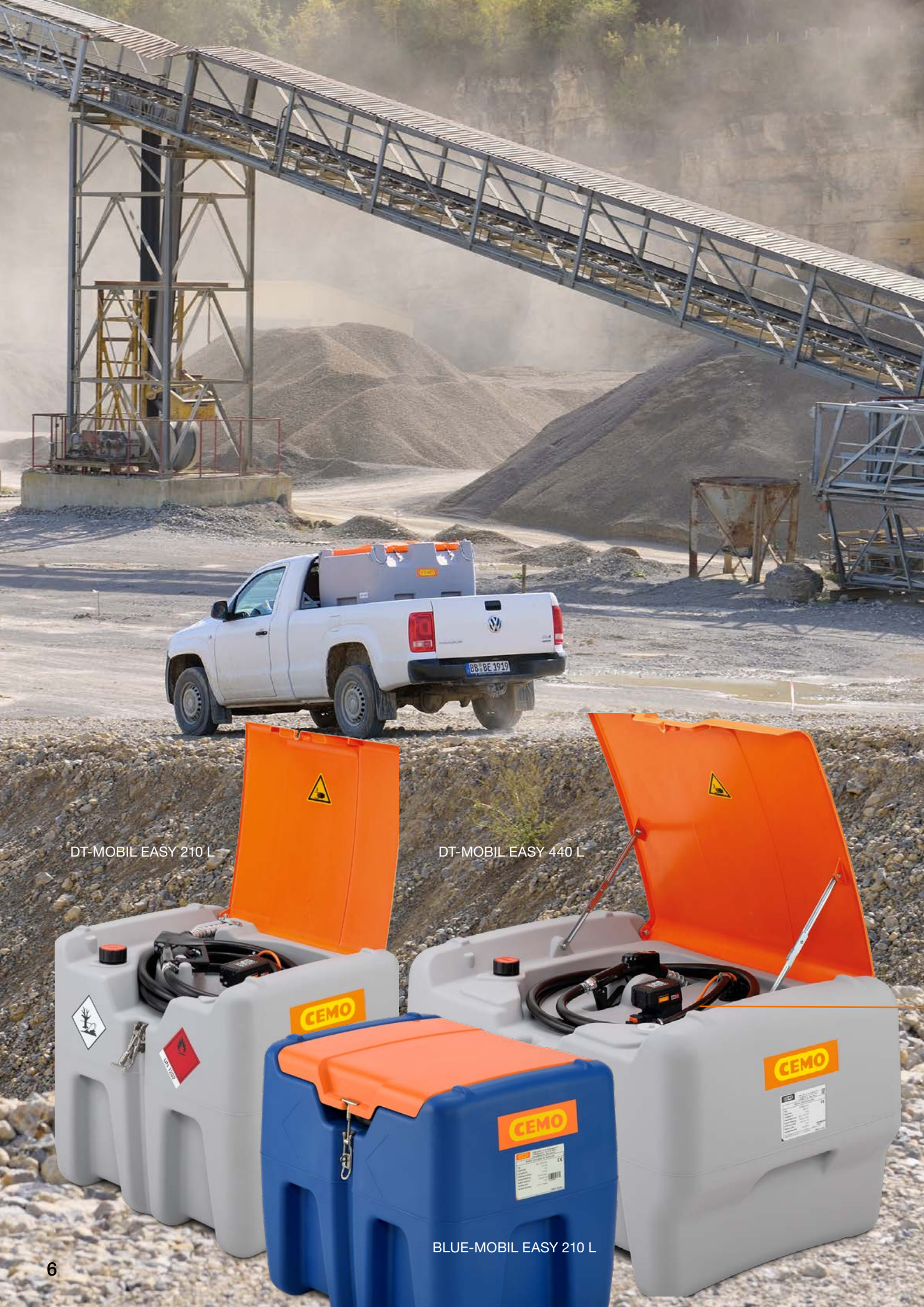
DT-MOBIL EASY 210 L